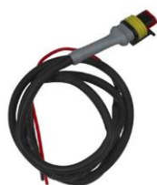
Control cable for Cyrix-ct 12/24-230 Length: 1 m